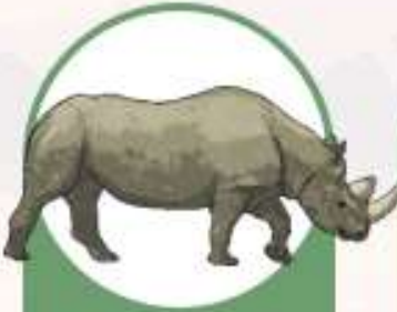
West African Black Rhino