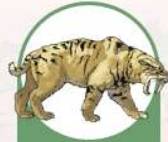
Saber- Toothed Cat